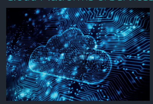
Providing access to data and applications from anywhere is the #1 reason for cloud adoption.

Q Associates provides cloud computing solutions to support our customers' strategic business objectives. We work with clients to migrate suitable workloads and data, utilising the world's leading public and private cloud services.